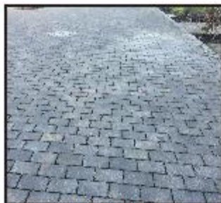
Permeable Block Paving