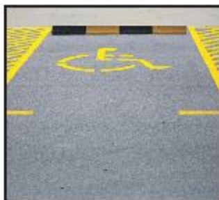
All Types of Markings