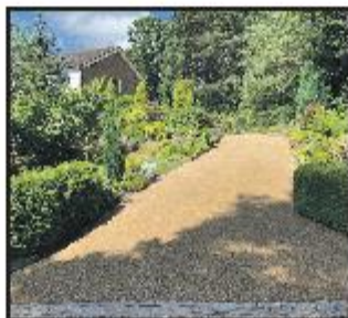
Bitumen & Gravel