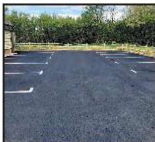
New or Refreshing Old Markings