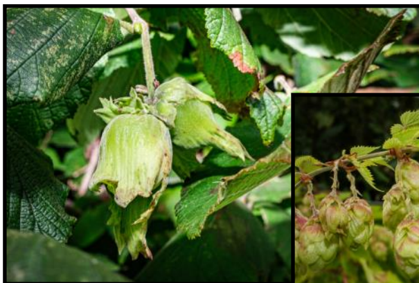
Sutton Valence Allotments, cob nuts and hops