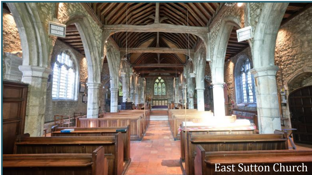
East Sutton Church