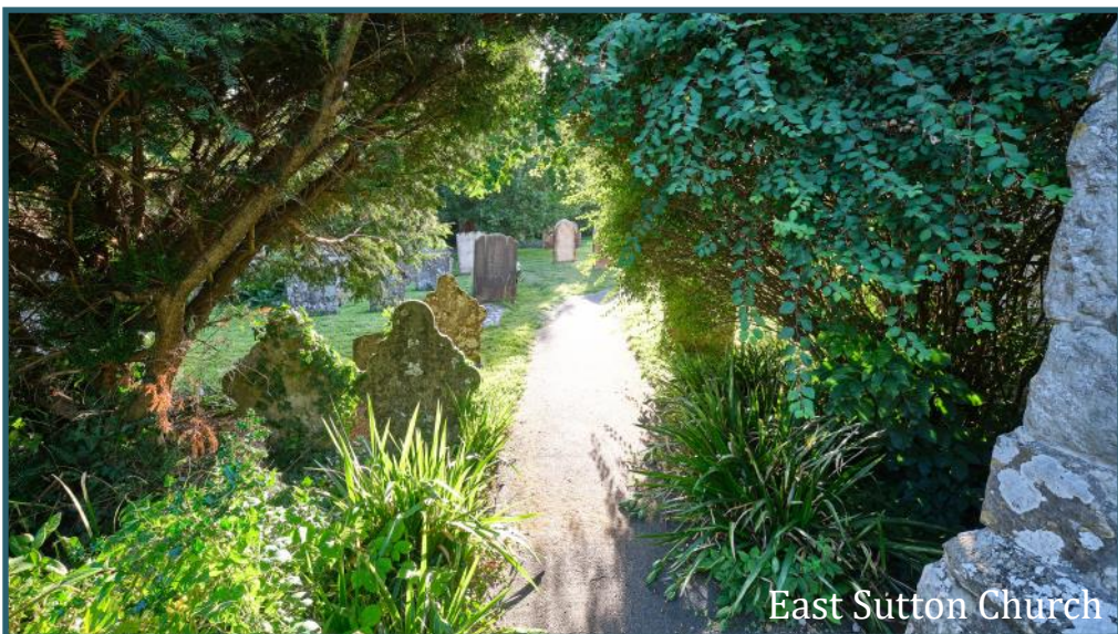
East Sutton Church