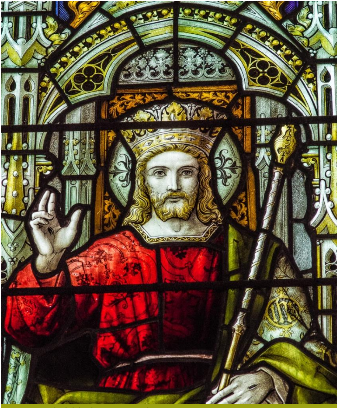
Some material included in this service is copyright:

Common Worship © The Archbishops' Council 2000 Common Worship Times & Season © The Archbishops' Council 2006 © Archbishops' Council2013 Common worship Daily Prayer© The Archbishops' Council 2005 Wild Goose publications©the Iona Community 2016 Celtic Daily Prayer © Northumbria Community Trust 2000